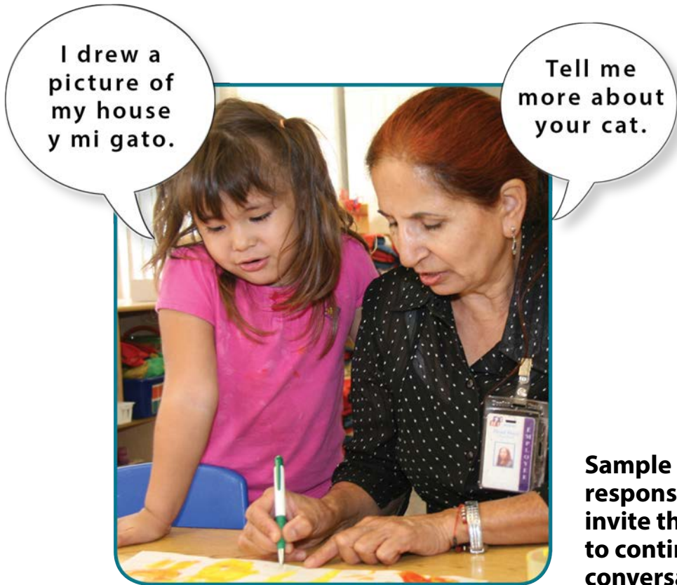
Sample adult responses that invite the child to continue the conversation